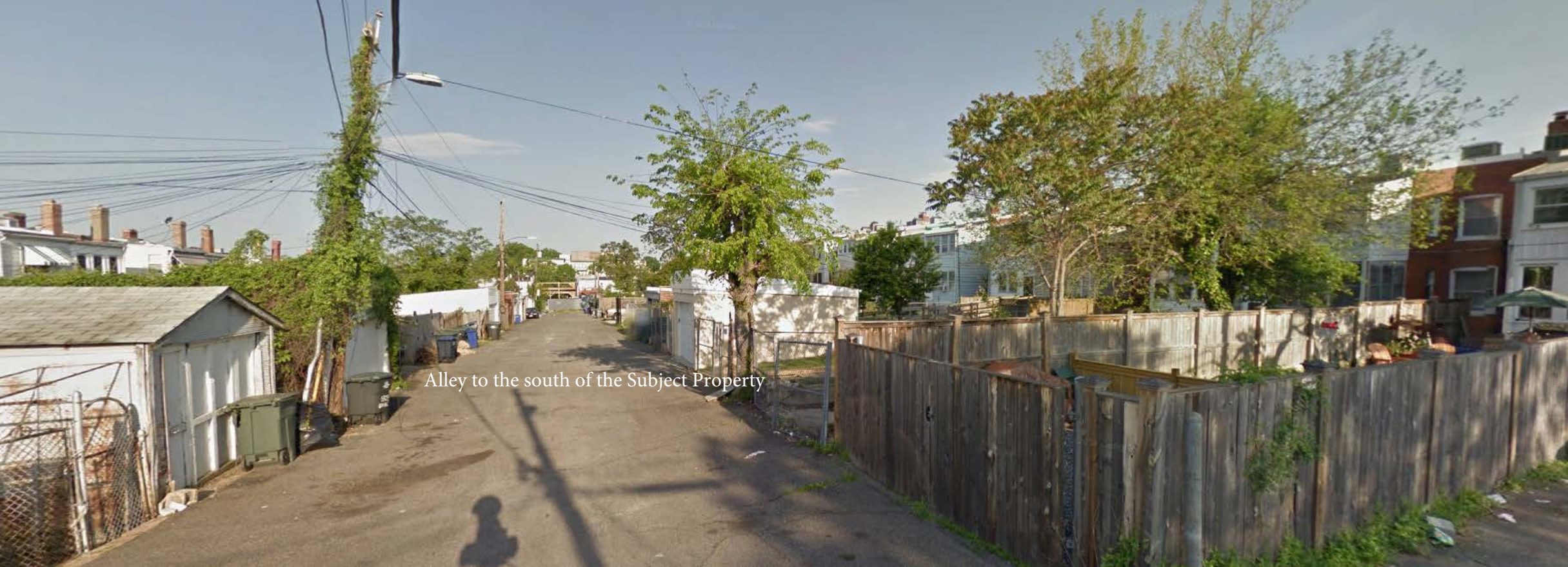
Alley to the south of the Subject Property